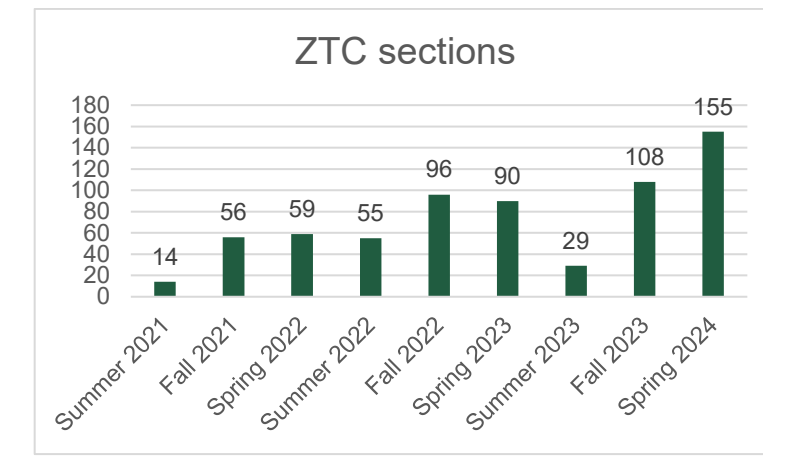
Figure 1: ZTC Sections, Summer 2021-Spring 2024