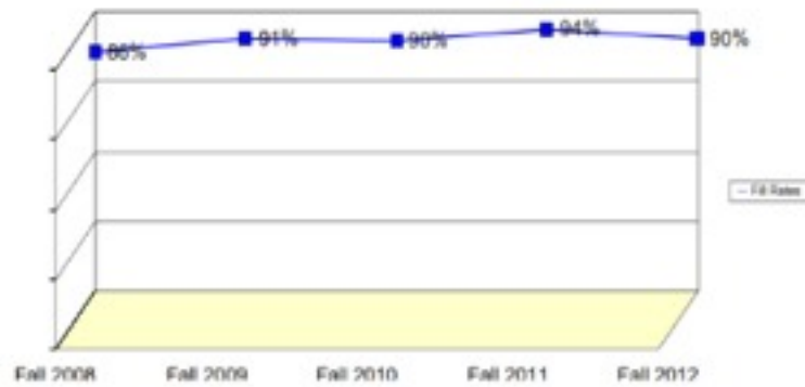
Department Fill Rates by Term