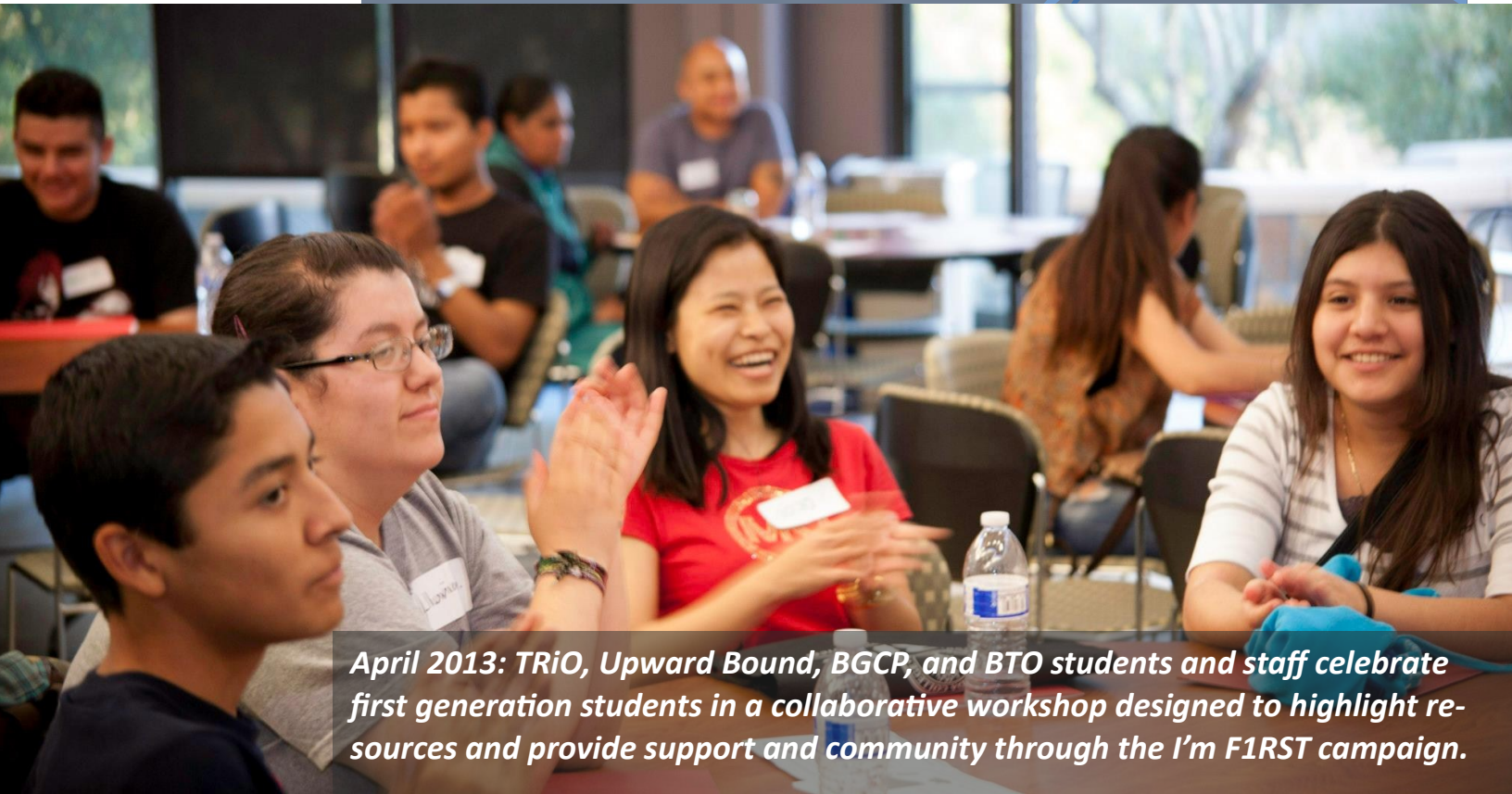
April 2013: TRiO, Upward Bound, BGCP, and BTO students and staff celebrate first generation students in a collaborative workshop designed to highlight resources and provide support and community through the I'm F1RST campaign.